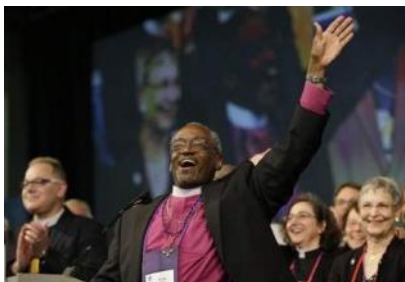
The Right Reverend Michael Curry

The General Convention of the Episcopal Church has the duty of selecting the Presiding Bishop, who will serve the church for a term of nine years. Acting as the President of the House of Bishops, and the Chief Pastor of the national church and its nine ecclesiastical provinces, the Presiding Bishop provides leadership in initiating, developing, and articulating the church's policies and strategies.