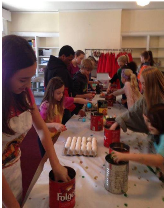
Coloring Easter Eggs - March 20th

Join the Christ the King Youth Ministry team for a night of awesome games, activities, snacks, worship, prayer, and teaching but mostly epic games, and no sleep! The annual Cathedral Lock-In is happening Friday April 1st at 6:00 p.m. - Saturday April 2nd at 9:00 a.m. at The Cathedral of All Saints, 62 South Swan St., Albany, NY 12210. All kids in 7th-12th grade should come out for this fantastic night of fun and games with a Clue theme at the Cathedral. This is a great retreat to bring a friend. Cost is $25 per person. More Info at: http://www.beavercrossministries.org .