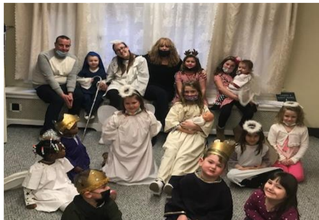
Sunday School Pageant