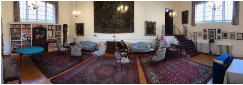
Pumpelly Room Before