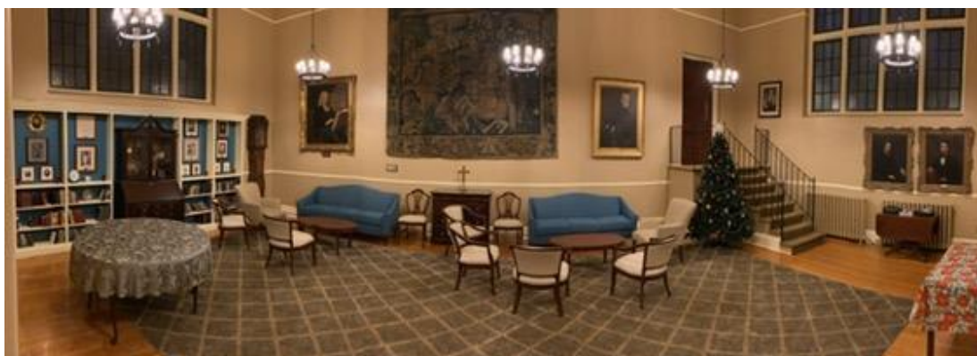
Pumpelly Room After