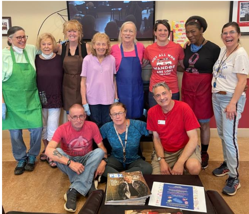
The Albany Damien Center

St. Peter's is a proud supporter of The Albany Damien Center, which was started in 1988 as a one-room drop-in center for people living with HIV and AIDS. It has grown to offer a full range of services to its members, including housing, meals, nutrition education and groceries, employment training and support, an onsite pharmacy that offers a range of AIDS medications, onsite counseling, assistance with keeping members and their pets together, and an environment where all the members are welcome and accepted. The Center is funded by public assistance, private grants and individual donations, and relies heavily on volunteers. This year St. Peter's was well represented at the annual BBQ to kick off the summer.