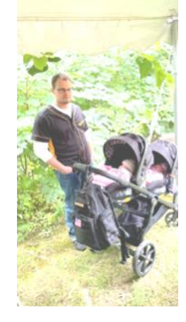
A Special Thanks to the chefs and all who contributed to make this such a wonderful day !