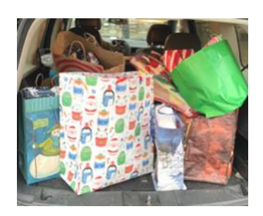
Thank you to all that donated a gift to the Southend Children's Café

Thank you all for donating food for the free food cabinets at the South End Children's Café.