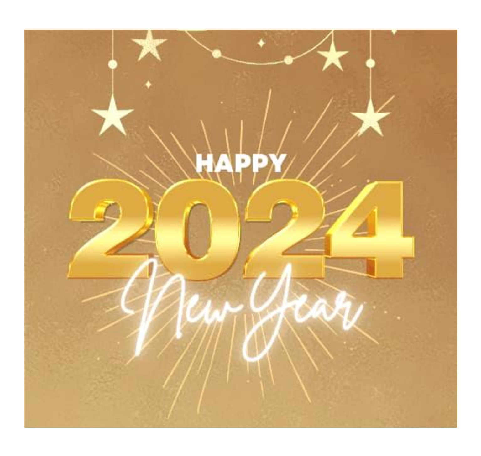
We wish you a Happy and Healthy New Year 2024 From All of us at St. Peter's Church