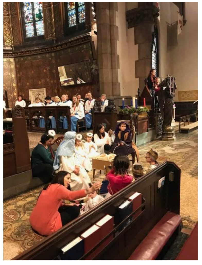
Children of St. Peter's perform the Annual St. Peter's Christmas Pageant December 10th, 2017