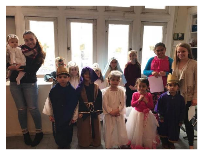
The cast from our Christmas Pageant 2017.

Beaver Cross beats the mid-winter blues with our annual winter retreat! From epic snow fights to cocoa and cookies, we make the best of the cold weather. Most of all, we learn more about Christ. For more information or to register, call 518-692-9550.