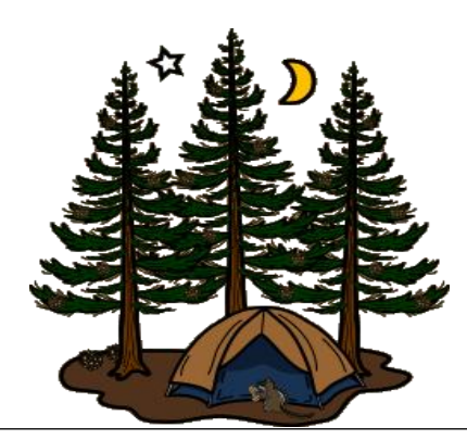
Beaver Cross Camp Dates!

Registration for Beaver Cross Camp is now open! Experience the adventure of summer camp by being part of Beaver Cross Camp communities devoted to faith, friendship and fun. At Overnight Camp and Day Camp, campers explore and deepen their faith together through dynamic teaching and activities. New friendships are created and old ones rekindled as campers laugh and learn together in the environment they themselves help create to be safe, encouraging and fun. To register online for camp, https://registration.campbrain.com