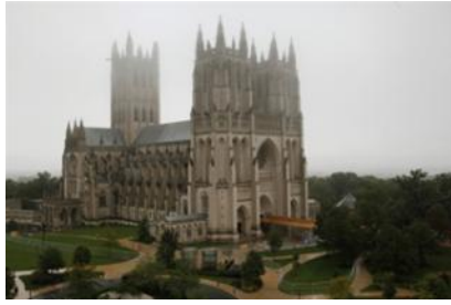
Washington Cathedral of the Episcopal Church

The Episcopal Church is defined as a church governed by bishops. Our church, St. Peter's Protestant Episcopal Church is a United States-based member of the worldwide Anglican Communion. If we look at world maps of the Anglican Communion we can see that it is divided into nine provinces: there are dioceses in the United States, Taiwan, Micronesia, the Caribbean, Central and South America, the Convocation of Episcopal Churches in Europe and the Navajol and Area Mission.