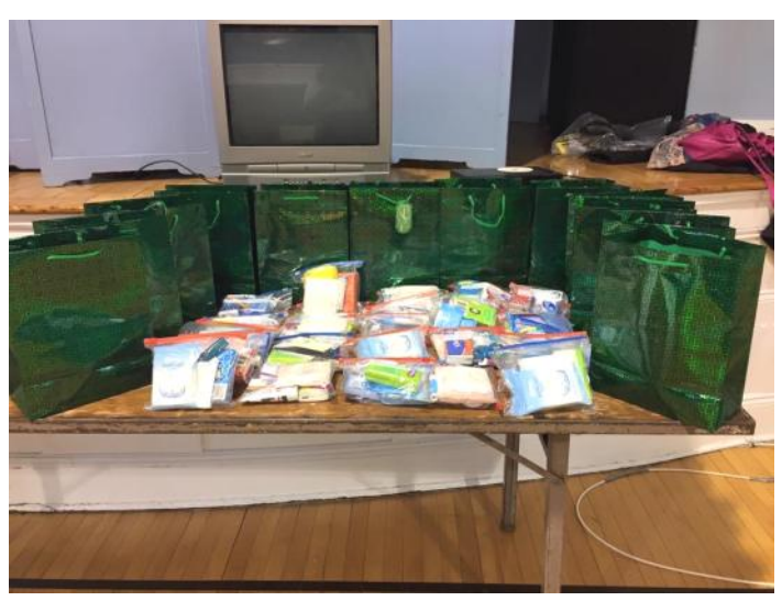
Daughters of the King and Others ~ January 15th Stuffing Blessing Bags for the Overflow Shelter