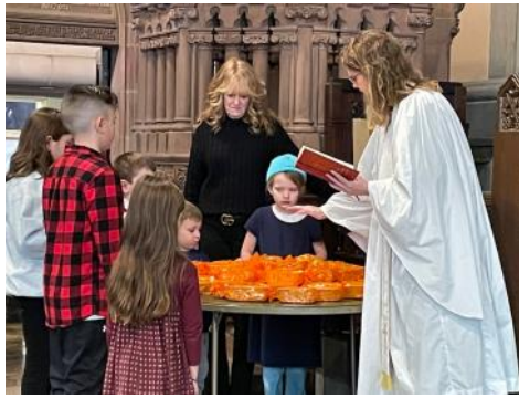
Blessings of the Pumkin Bread